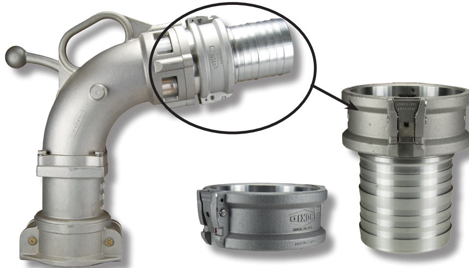
assembled with 6200 series elbow